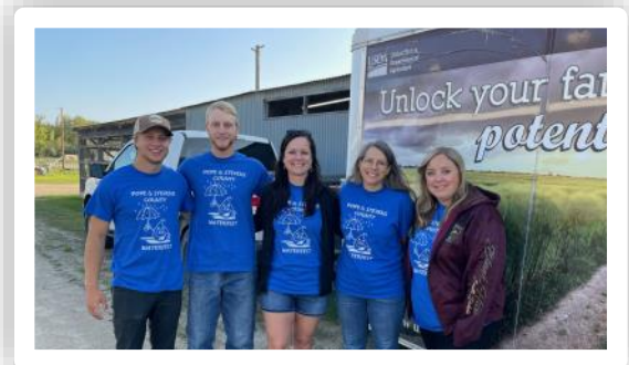
Pope SWCD Staff