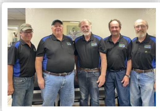
2025 SWCD BOARD OF SUPERVISORS