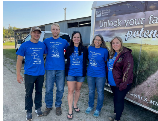
2024 Board and Staff