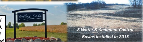
8 Water & Sediment Control Basins installed in 2015