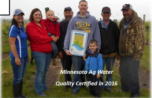
Minnesota Ag Water Quality Certified in 2016