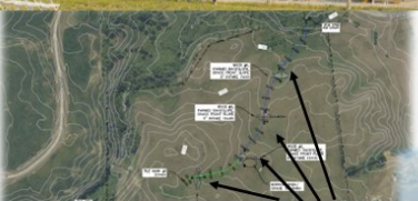
6 Water and Sediment Control Basins Planned for Fall of 2023, 47 acres of No-till (2025) and Cover Crops (2024) also planned