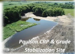
Paulson CRP & Grade Stabilization Site