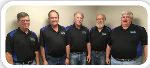
SWCD BOARD OF SUPERVISORS