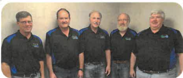
2020 SWCD BOARD OF SUPERVISORS