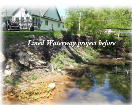
Lined Waterway project before