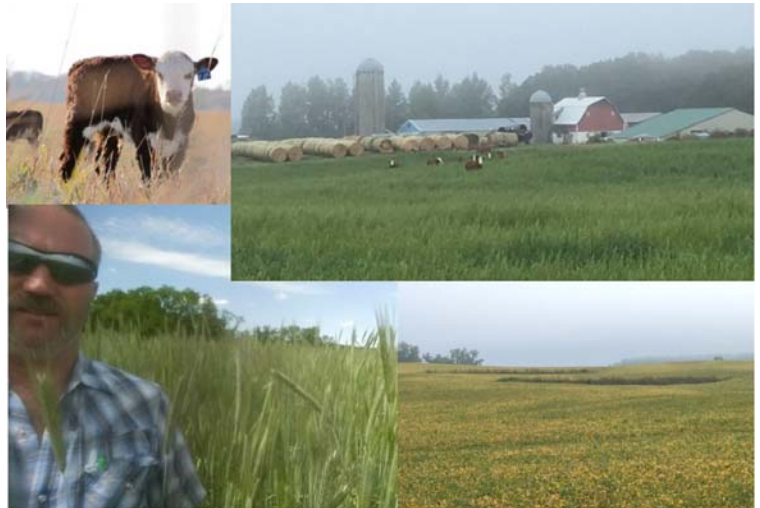
Pictured above: cover crops including rye, cow calf cattle operation, and water and sediment control structures on the Koubsky farm