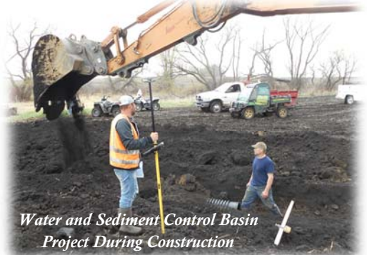
Water and Sediment Control Basin Project During Construction