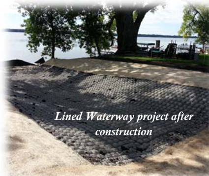
Lined Waterway project after construction