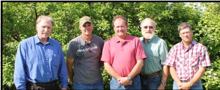
SWCD BOARD OF SUPERVISORS