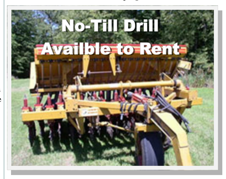
Call today to set up a time to meet with staff to discuss your project and provide an estimate. Ask for Kelly!

The Pope SWCD offers a complete package of services and products to aid in implementing native grass plantings enrolled in conservation programs.