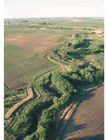
Riparian, or streamside, plantings of trees, shrubs and grasses make excellent connecting corridors. They can sometimes be a wildlife oasis in a sea of crop fields.

In most situations, landowners creating corridors may want to consider a design that is edge feathered, which includes zones of grasses, shrubs and trees all in the same corridor. The center of the corridor would be planted to trees, with strips of shrubs on each side, bordered on the outside by zones of grasses and legumes. This combination offers habitat for wildlife that may use all three types for food and cover, as well as wildlife that needs only one of the habitat types. For more information stop by our office at 1680 Franklin Street in Glenwood.